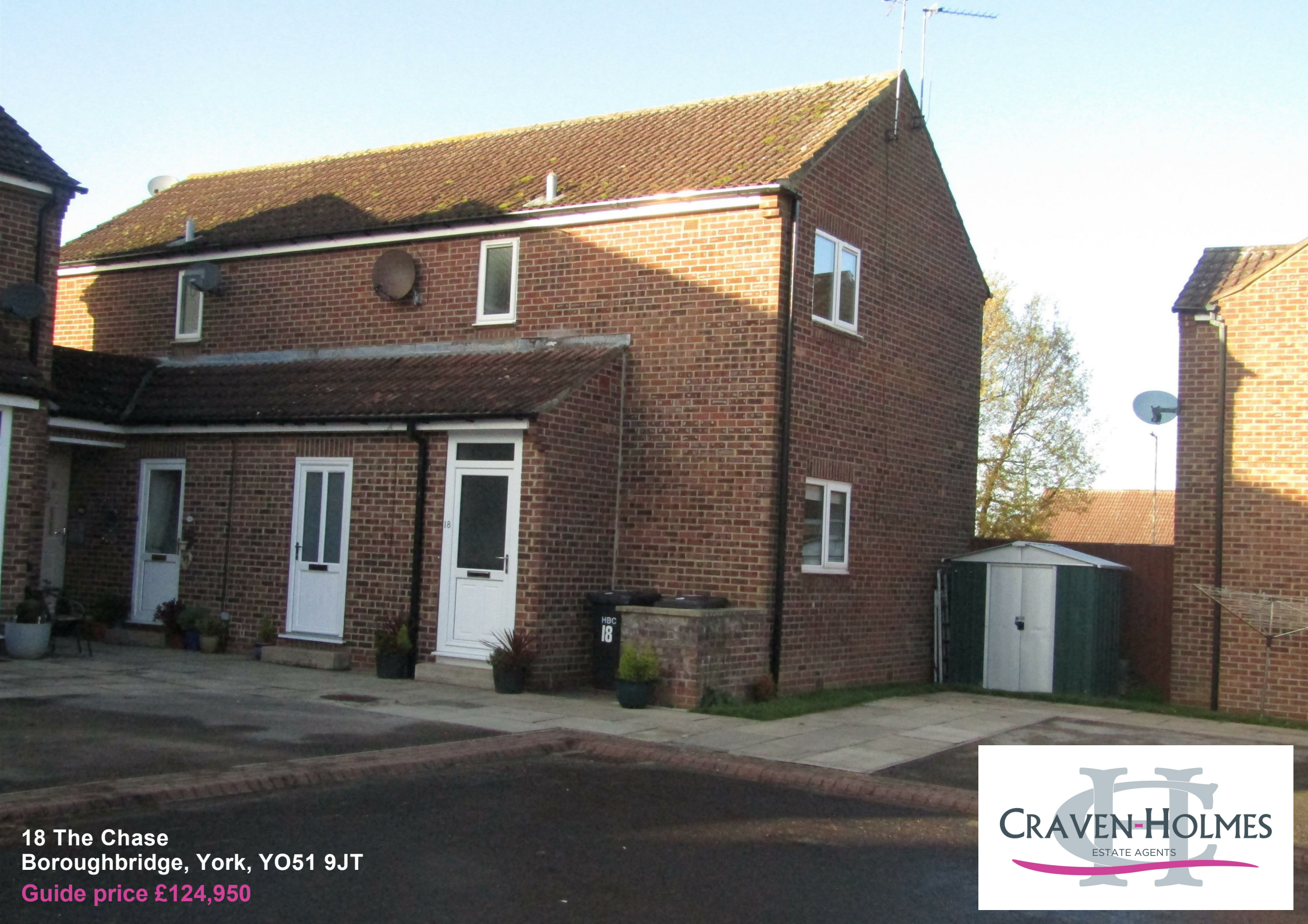
18 The Chase Boroughbridge, York, YO51 9JT Guide price £124,950